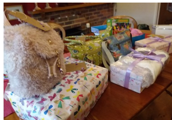
Children's Bags and Shoeboxes