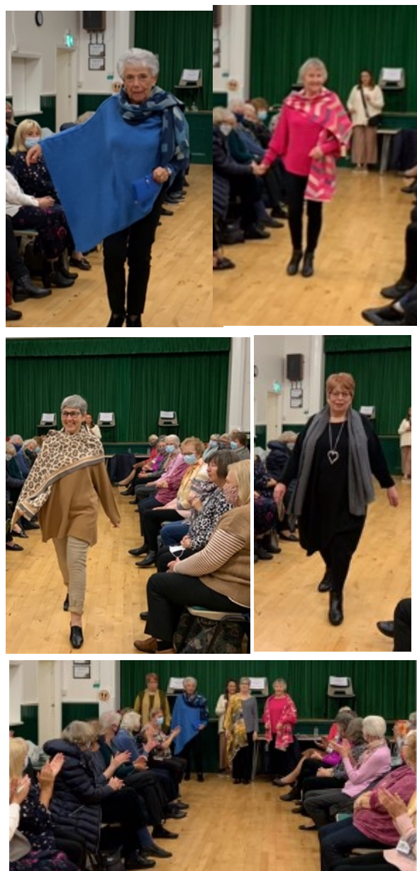
Photos of a fashion show from Lottie's Loft for BEARSTED GREEN WI

All activities subject to any change in Covid restrictions.