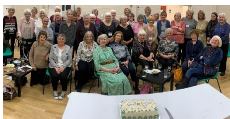
Hadlow WI celebrating their 11th birthday with wine, women and song. After a short business section, lights were dimmed, disco lights

Please contact the office if interested.