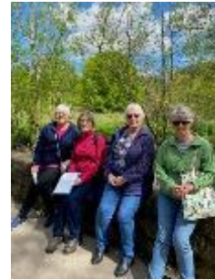
South Park WI