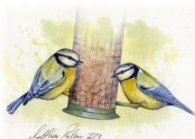
Blue Tits on Feeder