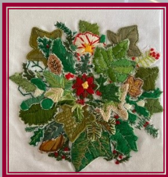
I received a collection of winter foliage from 13 members which I've appliquéd to cotton fabric .