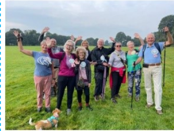
10 miles walkers

On the day (19 September) that the original fun walk was due to happen the WI organised two walks for