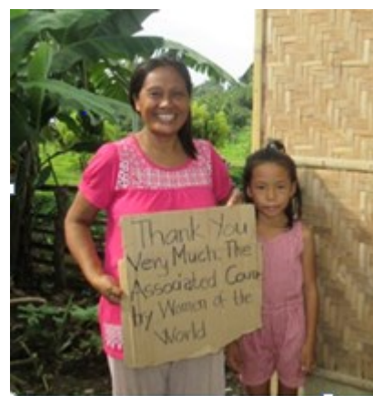
A beneficiary of Project 1018 and her daughter standing in front of one of the new latrines.