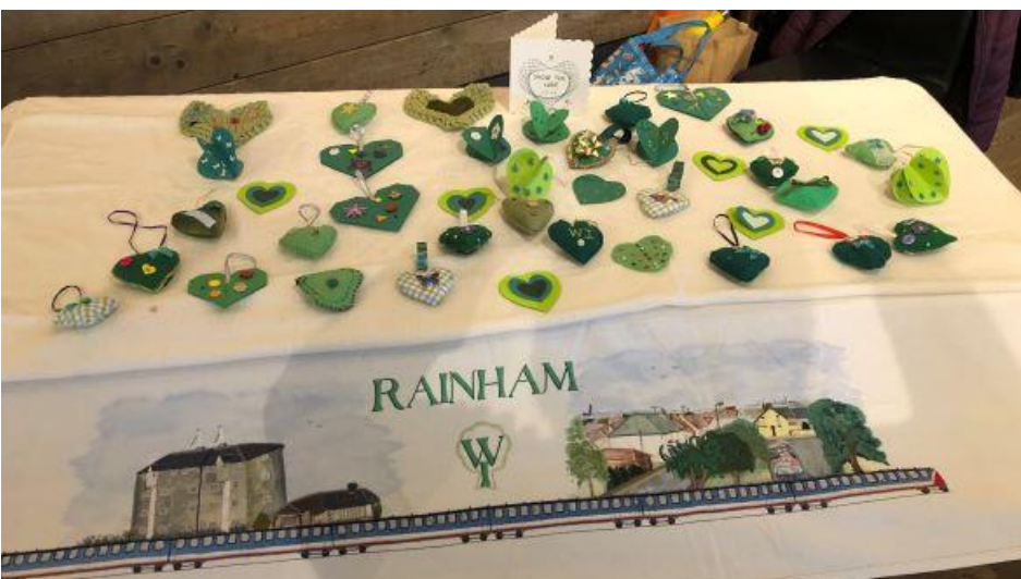
RAINHAM WI Members bought in over 40 knitted, sewn, card and paper Green Hearts.

Articles, your events Please no more than 150 words and two photographs. Congratulations and Obituaries (no more than 40 words) . If possible email direct to westkentnews@wkwfi.org.uk If not please post to our Ethel Hunt Lodge address see top of page two.