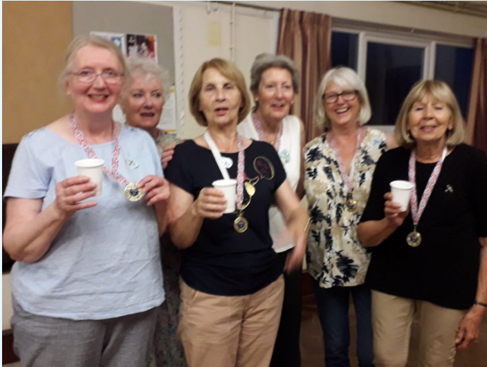
Petts Wood Spitfires