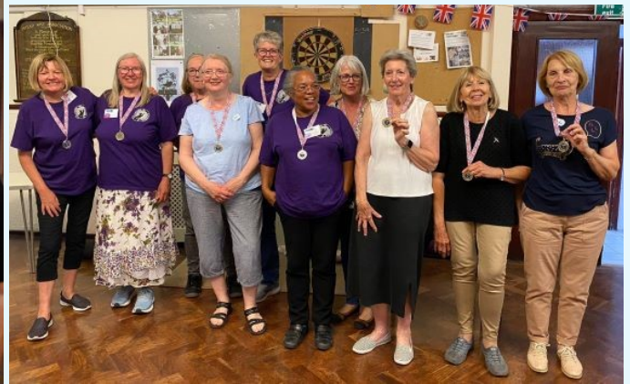
Runners up Catford Furballs with Petts Wood Spitfires