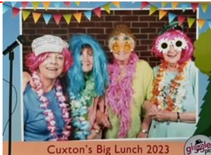
Cuxton's Big Lunch 2023

To enable WIs to receive their ordered copies of the WKN by the first of the month and for it to be displayed on the website earlier you may find some of your articles will feature in the following month's edition rather than the next month. All appear in the order they are received.