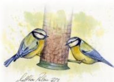
Blue Tits on Feeder

Ticket application form on back page. Closing date Friday 9 August.