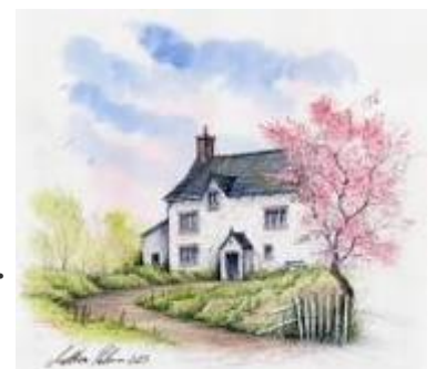
Cottage with Cherry Blossom