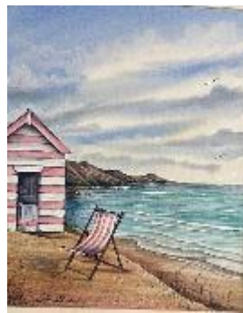
Beach Hut & Deck Chair