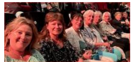
Right: Ladies of Highgate Hawkhurst WI