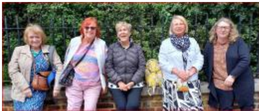
Left: Ladies of Crockenhill WI