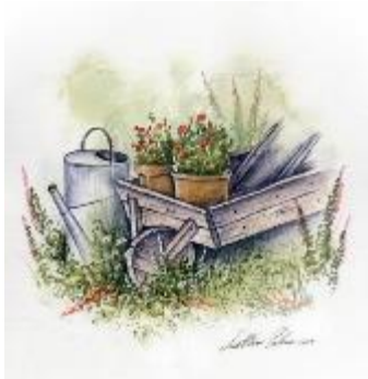
Country Garden—Still Life

Kit charge £ 5. in cash to tutor on the day. Members Only. Bring a packed lunch and a mug for coffee.