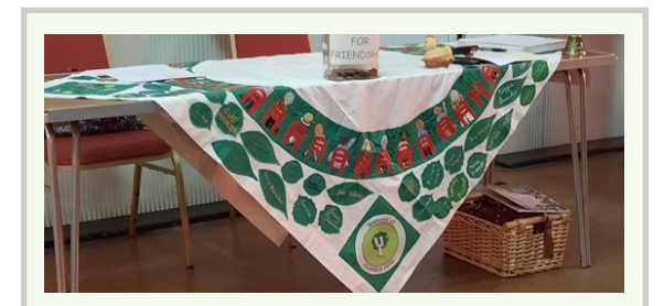
Barming WI tablecloth displayed at their meetings