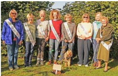
Donated by Highgate Hawkhurst WI to commemorate the Coronation of King Charles III on 6 May 2023

To commemorate the Coronation of His Majesty King Charles III, Highgate Hawkhurst WI planted a cobnut tree on the King George V field in the village. Nicknamed 'Nutty', the tree was acquired from Potash Farm in July. We have managed to keep him going until a suitable plot was found and hope that he will flourish, along with our King!