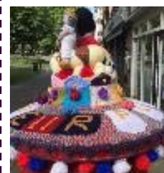
President. St. Michaels WI

'Toppers' for four of our local post boxes. All four post boxes were decorated last evening in the rain,