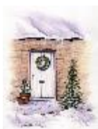
Thursday 8 September Christmas doorway