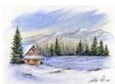
Wednesday 7 September Cottage in the snow