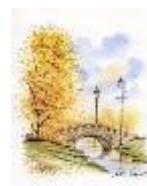
Friday 9 September Autumn Woodland with stream